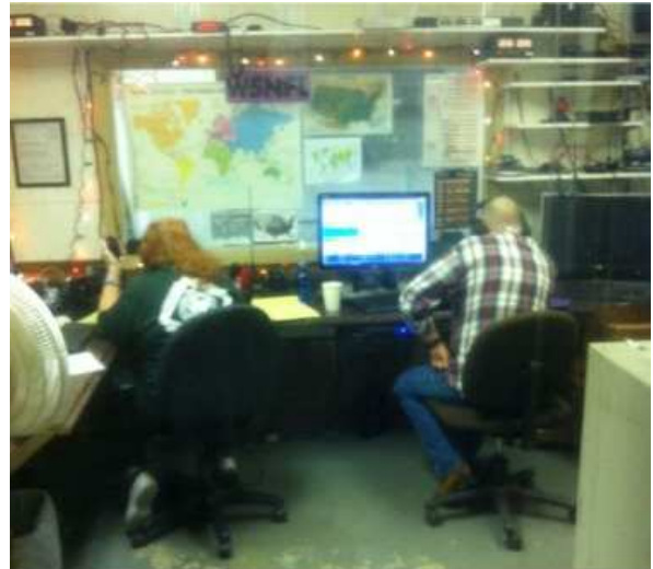
K5RCM & KC5KIJ