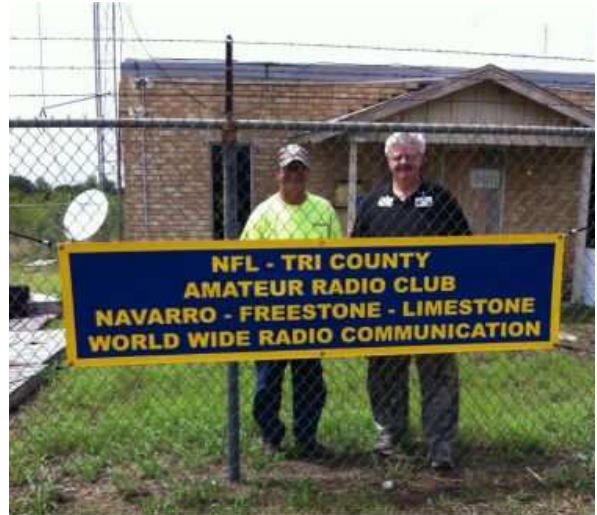
KF5KHS & KW5MOS