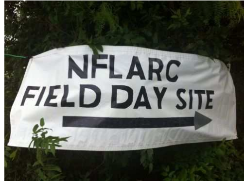
Banner at drive entrance